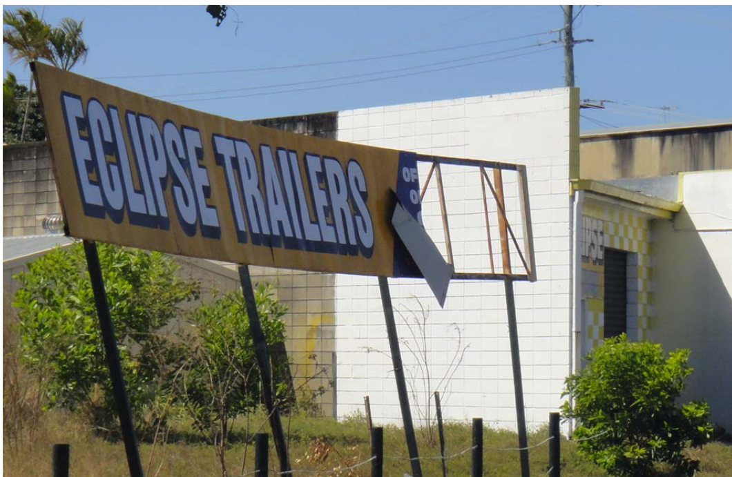
Figure 9: Climatic event left its trace