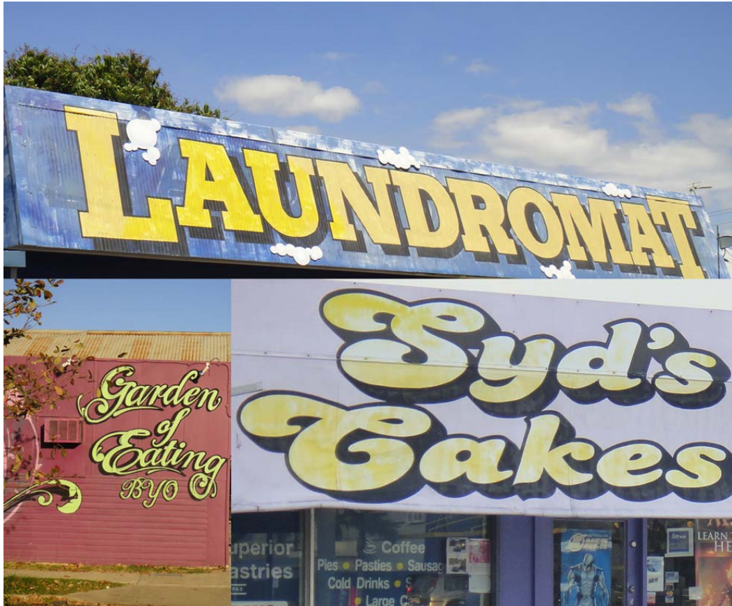
Figure 7: Typical hand-lettering

Uniqueness, however, is predominantly created through the faded, the scratched and weathered, or otherwise worn-out aspects of the lettering written on the walls and shop fronts. Townsville's signage clearly shows its geographical location, be it as a result of the many hours of daily sunshine taking its toll on the painted signage (Figure 8), or through such events as cyclones. One such event was Yasi, in early 2011, which left its traces on some of the signage (Figure 9).