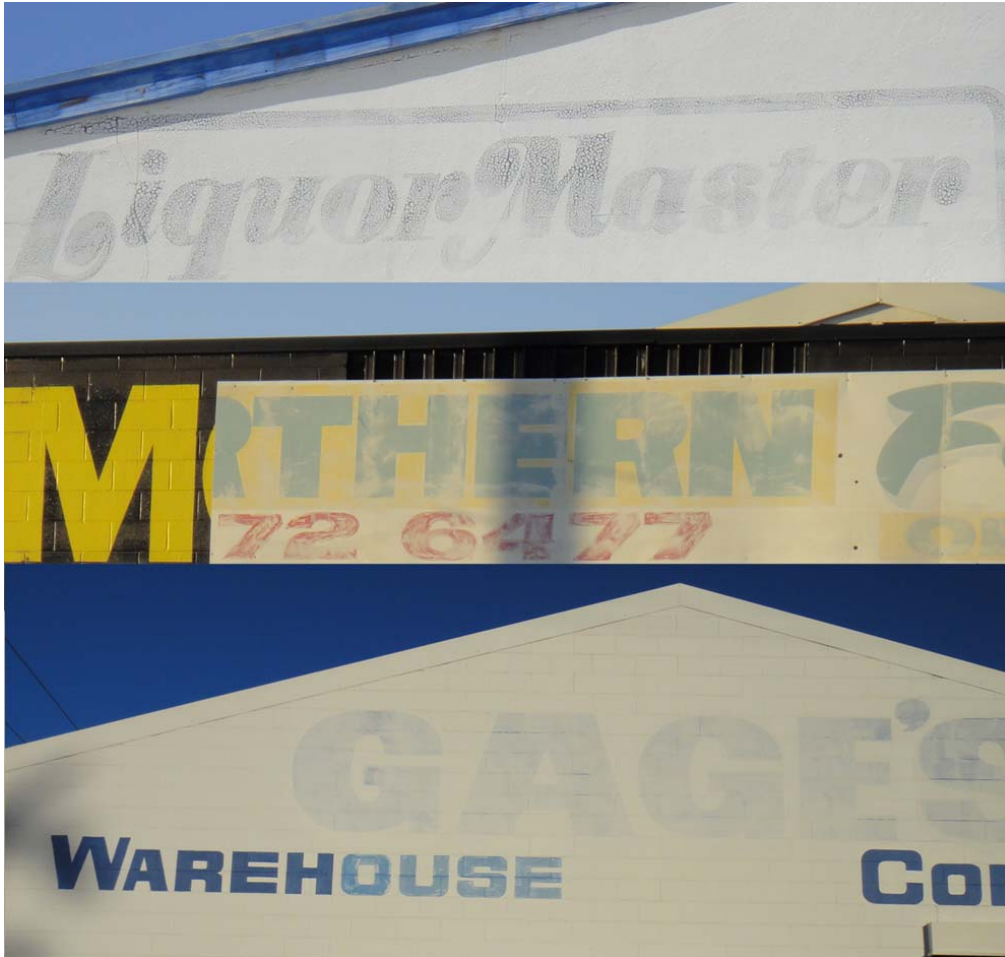
Figure 10: Traces of change

Similar to the effects of weathering are the visible traces of ‘change’ evident in a number of signboards on Townsville’s shop fronts and business entrances. Old ownerships were crudely overpainted or perhaps professionally oversprayed but have simply failed to withstand the assaults of the weather. These visual reminders “denoting the physical passage of time” (Helfand 44) provide a document of local history, forming an essential part of the charm of Townsville’s signage (Figure 10).