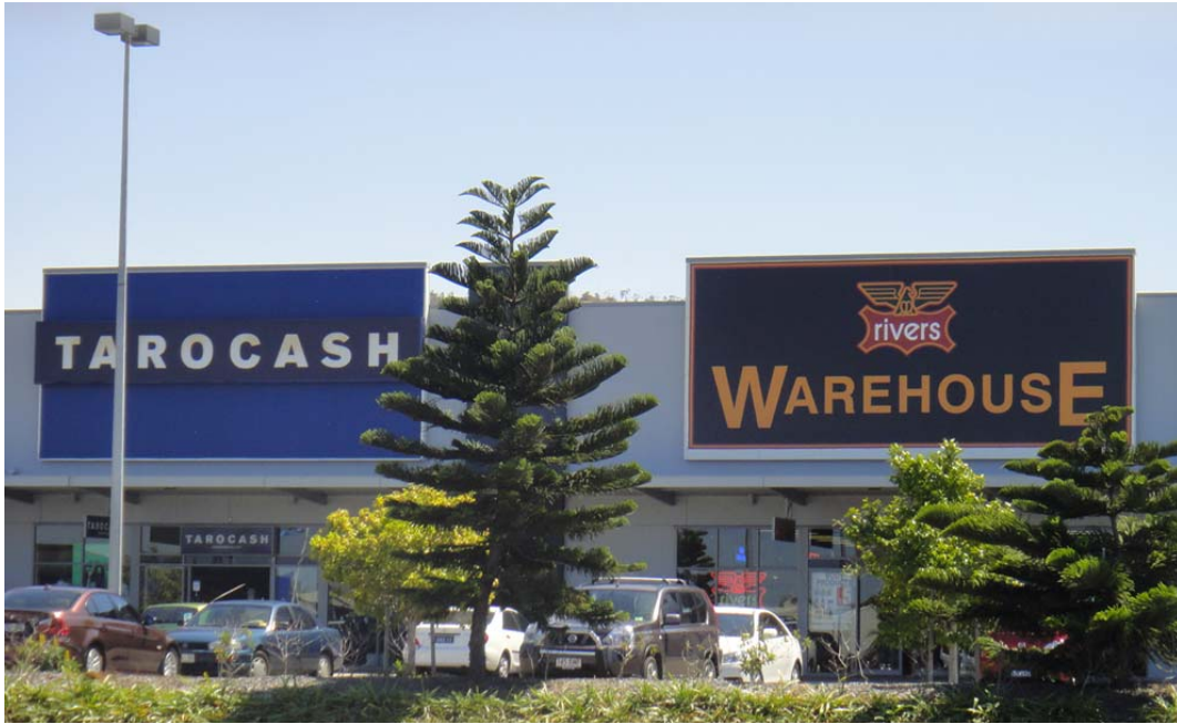
Figure 11: Shopping complex in Townsville

Townsville is similar to other growing cities worldwide, and, as such, Sprowl is unambiguous about its fate: “Globalization will take care and melt away any specific features within them before long”.