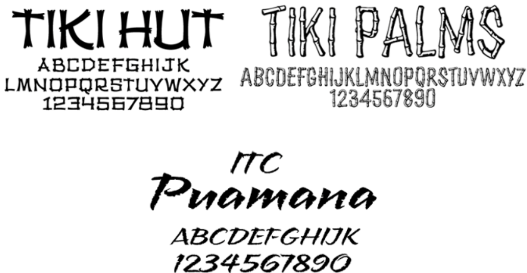
Figure 4: Typefaces Tiki Hut, Tiki Palms and ITC Puamana

Typefaces can indeed “visually reflect very closely the time and place in which they were made” (Antonelli). One well-known example of a ‘tropical’ typeface is the family of eight island-inspired Tiki Type fonts created by the type foundry House Industries. The designs for Tiki Hut, Tiki Wood and Tiki Palms, for example, were influenced by the place, history and culture of the Polynesian islands (Borden). Another typeface is the ITC Puamana, designed by Teri Kahan, which is described as capturing “the essence of the tropics, suggesting palm trees bending in an ocean breeze” (Haley 1) (Figure 4).