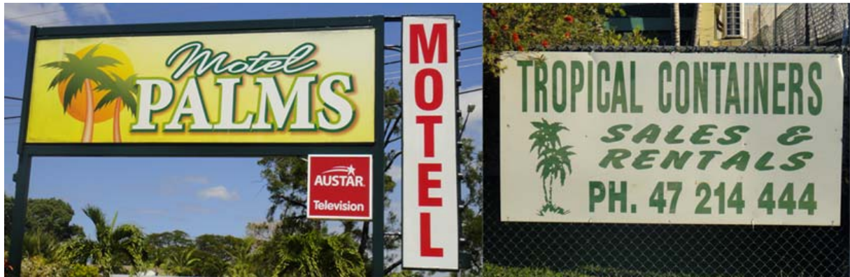
Figure 6: Signage with figurative elements

In search for Townsville’s typographic identity, made up of signage and lettering on walls, shops and other environmental signage, Townsville appears shy at first sight in advertising its tropical location. In contrast to Hawaii, distinct tropical typefaces such as the Tiki fonts or ITC Puamana are absent from the lettering and signage landscape in Townsville. However, it is not difficult to turn up signage with figurative elements including palm trees, the sun, or ocean wave, giving away its location (Figure 6).