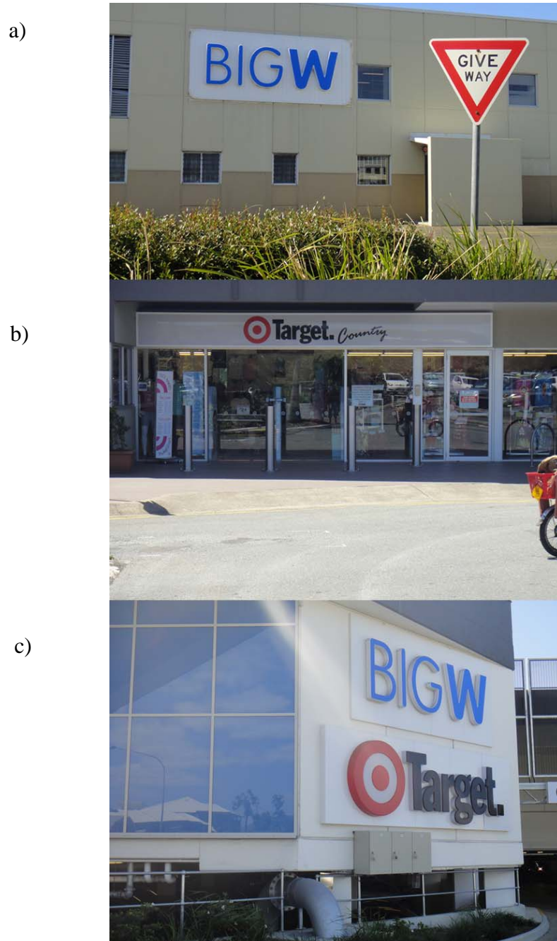
Figure 12: Where is this place? Department stores in (a) Kawana Waters at the Sunshine Coast (distance to Townsville 1280km), (b) Noosa (1020km), (c) Townsville

How to preserve Townsville's distinct sense of place? A fusion of past and the present might be created, designed to keep parts of Townsville's regional identity alive and so preserve a unique 'tropical flair' based on local history and tradition. It is time to take care of some of Townsville's unique vernacular signage, to archive it and maybe re-use it, maybe to create Townsville's very own tropical typeface.