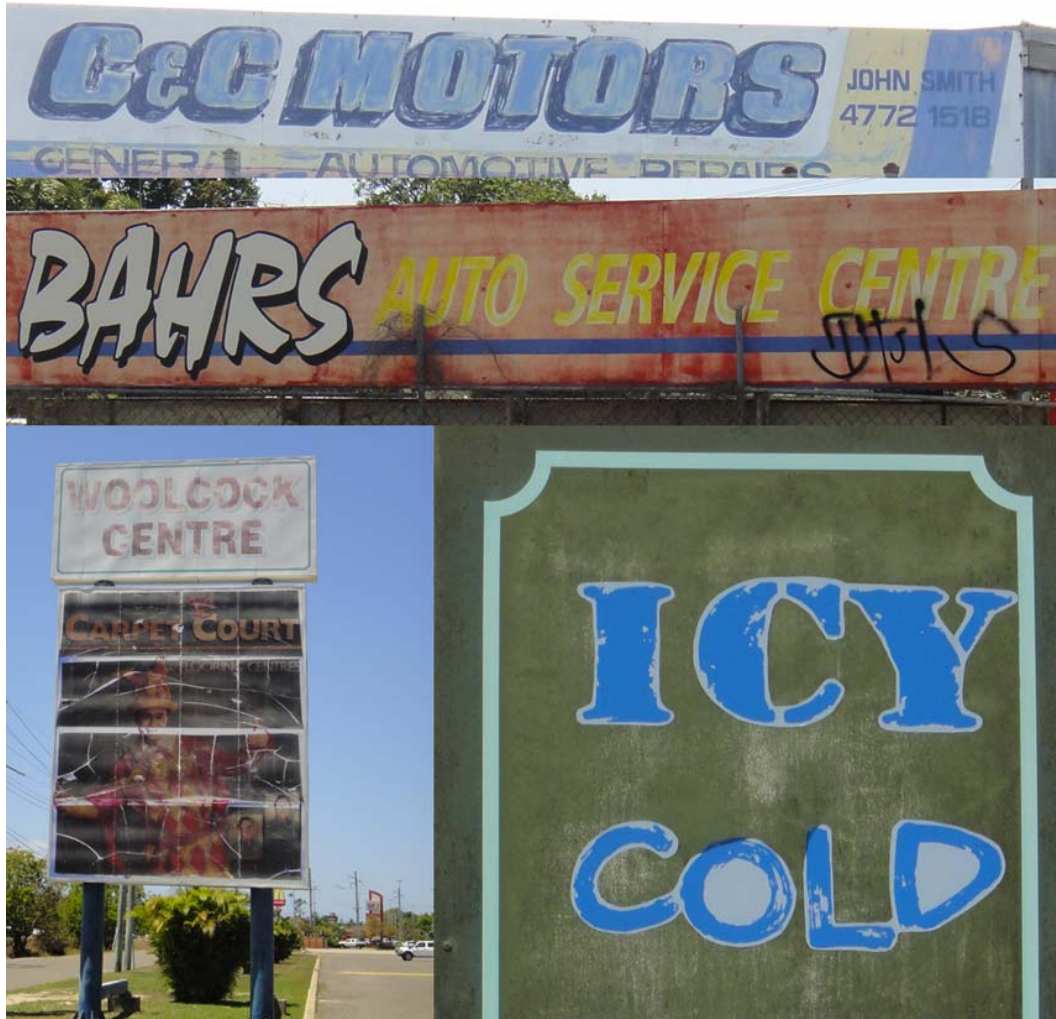
Figure 8: Exterior signage affected by the weather