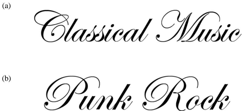
Figure 1: The elegant flow of harmonious and fluid lines which characterizes the typeface ITC Edwardian Script intensifies the meaning of word (a) whereas in (b) the same typeface undermines the meaning and may confuse or disturb the reader.

properties (the formal) (Ruder 14). These properties “dramatically affect the accessibility of an idea and how a reader reacts towards it” (Ambrose and Harris, Fundamentals of Graphic Design 38). They establish a resonance in the reader, which can be either inviting or repelling (Meggs 18). “The visual nature of typography is extraordinary for it can combine the time-space sequence and rhythm of music, the linear structure of language, and the dynamic space of painting” (Meggs 18). A typeface has its own personality which can infuse text appearing on a screen, a poster or a wall (Ambrose and Harris, Fundamentals of Typography , 162). The artistic representation or interpretation of characters can thereby intensify or contradict the meaning of words. This relationship between aesthetic form and semantic content is demonstrated by the example shown in Figure 1.