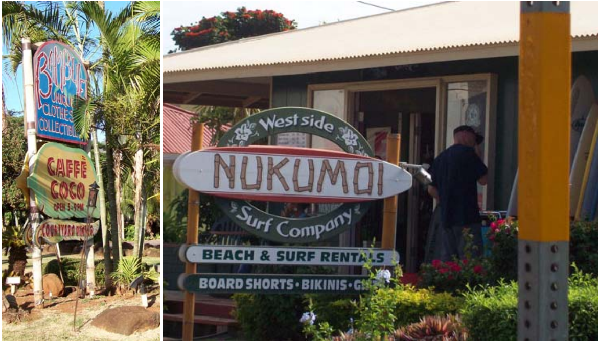
Figure 5: Signage in Hawaii. Tiki Palms is used for signage of a surf shop (right).