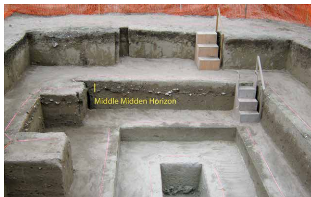
Figure 1 Bogi 1 during excavation showing location of the Middle Midden Horizon, which is the main Lapita-bearing deposit at this site, looking south, 26 March 2010.