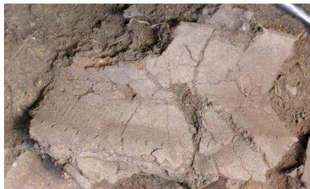
Figure 3 Comb dentate-stamped partial vessel with impressions on the carination from Lapita site Moiapu 1, Square F.

Part of the basis of Irwin’s questioning of the validity of the South Papua Lapita Province is what he sees as tenuous links with dubious claims for 2500 year old pottery in Torres Strait. McNiven et al.’s (2006) argument for ca 2500 year old pottery at Mask Cave in western Torres Strait was based on detailed assessment of site stratigraphy and chronology. McNiven et al. concluded that the evidence collectively and on balance pointed towards the deepest sherds dating to ca 2500 years ago within Phase 2 (2100–2600 cal BP) and not to the more recent pottery levels of Phase 3 (1500–1700 cal BP). Irwin’s suggestion that the deepest sherds represent downward movement of Phase 3 sherds would require massive disturbance of the deposit, for which there is no evidence. Ultimate resolution of this issue will require direct OSL or TL dating of the Mask Cave sherds. Whatever the case, McNiven et al. (2006:75) hypothesised that pottery dating back to 2800–2500 years ago would be found on the southern