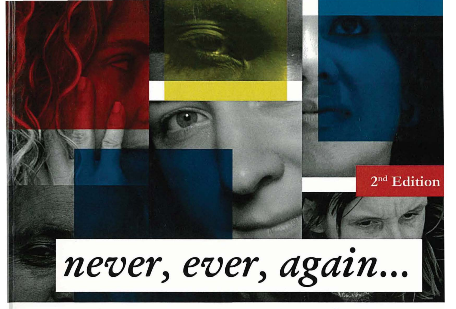
Why Australian abortion law needs reform