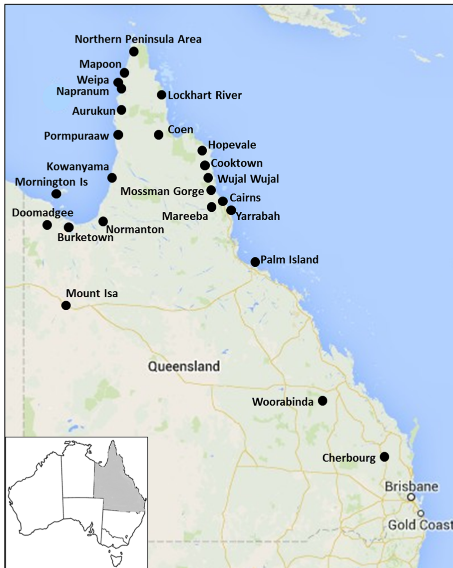
Figure 1 Indigenous communities and towns in Queensland affected by Alcohol Management Plans.

Additional people can be employed on a casual basis during visits to discrete communities; these community members act as local facilitators within the community. The majority of staff members have prior experience and qualifications working with Indigenous community members or in remote Indigenous communities in Queensland and in other Australian jurisdictions.