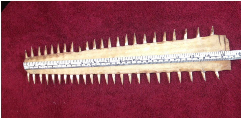
Fig. 2. Photograph of a dwarf sawfish rostrum supplied by an informant from the Solomon Islands. The rostrum was obtained in the Russell Islands in the central Solomon Islands during the 1960s.