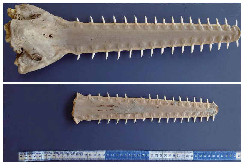
Fig. 2. Juvenile (top photo; captured 2016) and young-of-the-year (bottom photo; captured 2007) Pristis pristis rostra in Orla Viva NGO's collection of fauna specimens from the coast of Maranhão

Sawfish populations are in decline worldwide (Dulvy et al. 2016). Data regarding where these elusive creatures have sustainable populations are scarce (Fernandez-Carvalho et al. 2014). Conservation concerns in our study area arise due to the proximity of the sawfish capture points to the coast and human settlements. Human demographic growth in the region has been intense and has compromised much of the local ecosystem. Thus, sawfish stocks across the MAC are often subjected to habitat degradation as a result of mangrove deforestation, pollution (Silva et al. 2011), and strong artisanal fishing pressures. Areas such as the Canal do Navio, where 3 juvenile