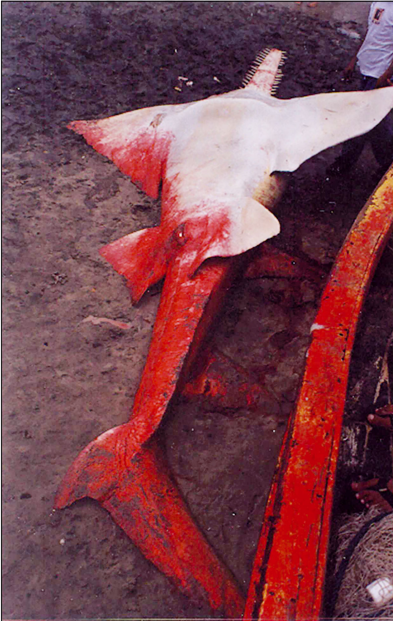
Fig. 3. Largest Pristis pristis female caught in the area to date (estimated total length: 700 cm). The individual was captured in 1998

specimens and a gravid female were caught, and Mearim River, where all catches consisted of juveniles, should be recognized as priority areas for research and conservation purposes. Despite the lack of data on sawfish biology and ecology, and the absence of continuous fishery-independent surveys in these areas, as recommended by Heupel et al. (2007), our data suggest that the Canal do Navio and the Mearim River might be potential nursery grounds for sawfish along the Amazon coast.